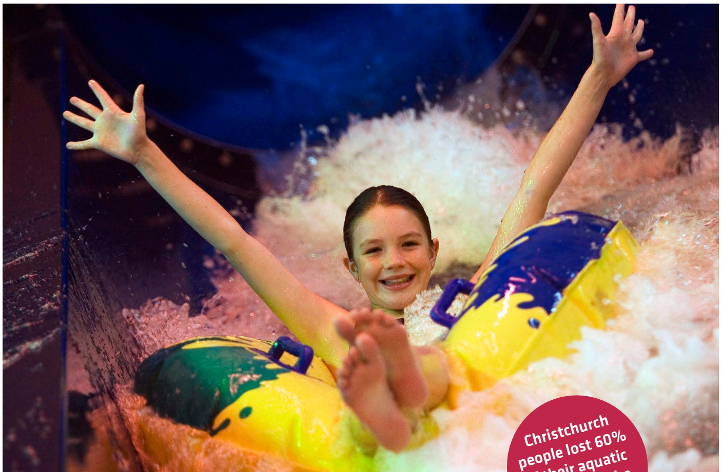
Now closed QEII Park hydroslide.

Christchurch people lost 60% of their aquatic facilities in the earthquakes.